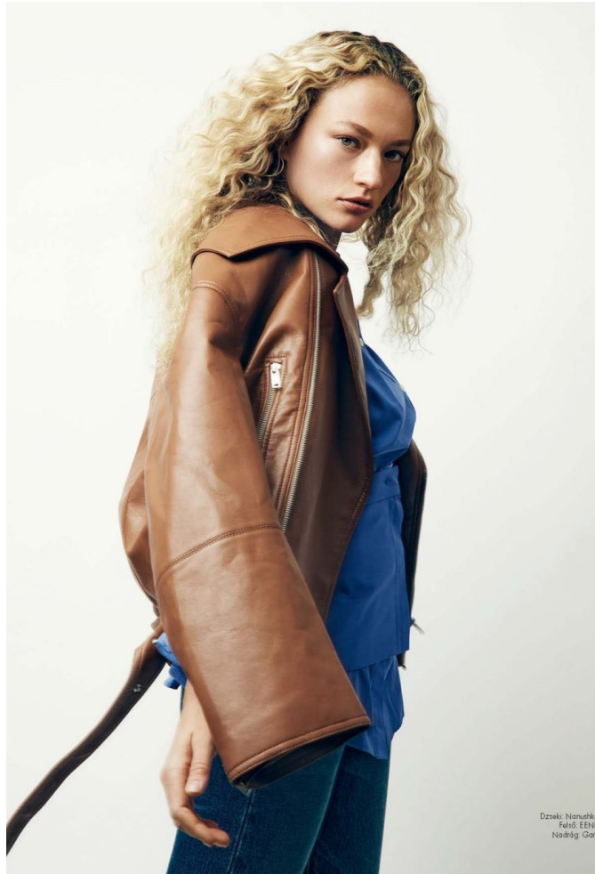
Dziewi: Nonushka Ręk: ECHÉ Nóżki: Clart