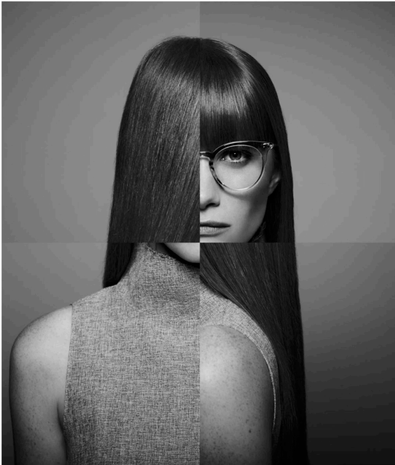
» Ezelle Buff Glasses Joni Blush Glasses Maison Margiela Top